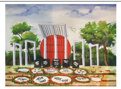
Shahid Minar, Dhaka University