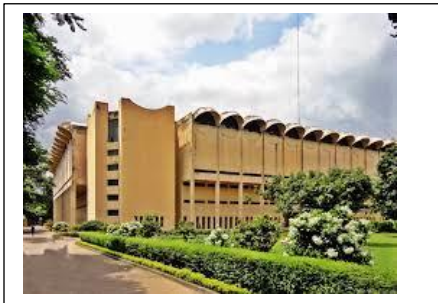
Bangladesh National Museum