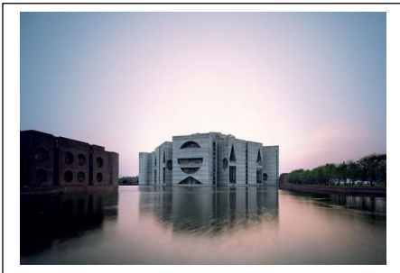
Parliament Building, Dhaka