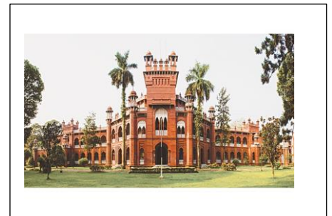
Curzon Hall, Dhaka University