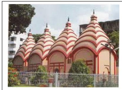
Dhakeshari Temple, Old Dhaka